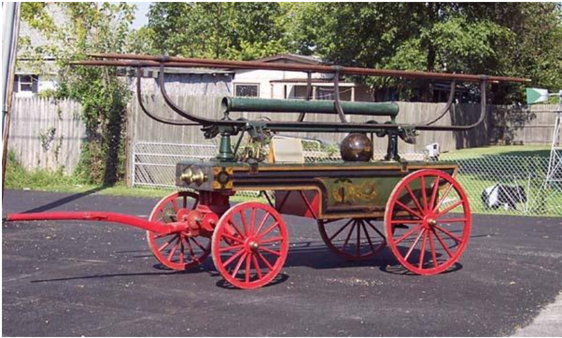
1886 Osgood Rumsey Pumper