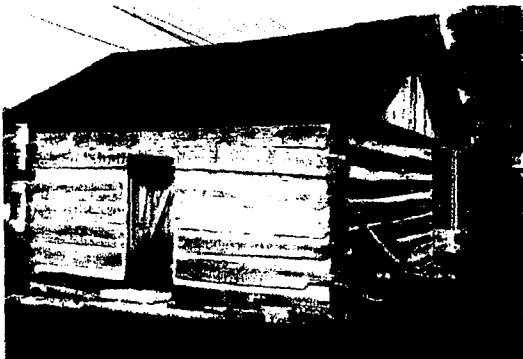
Funkhouser Smith-Engel Cabin