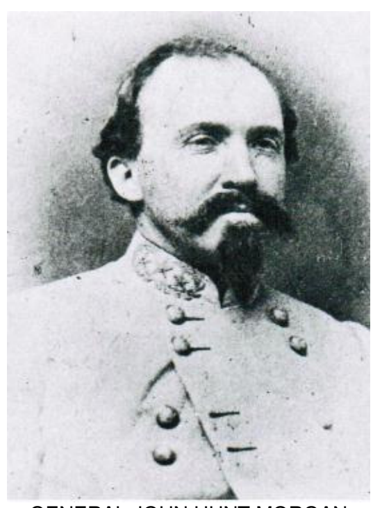
GENERAL JOHN HUNT MORGAN LAST PICTURE TAKEN