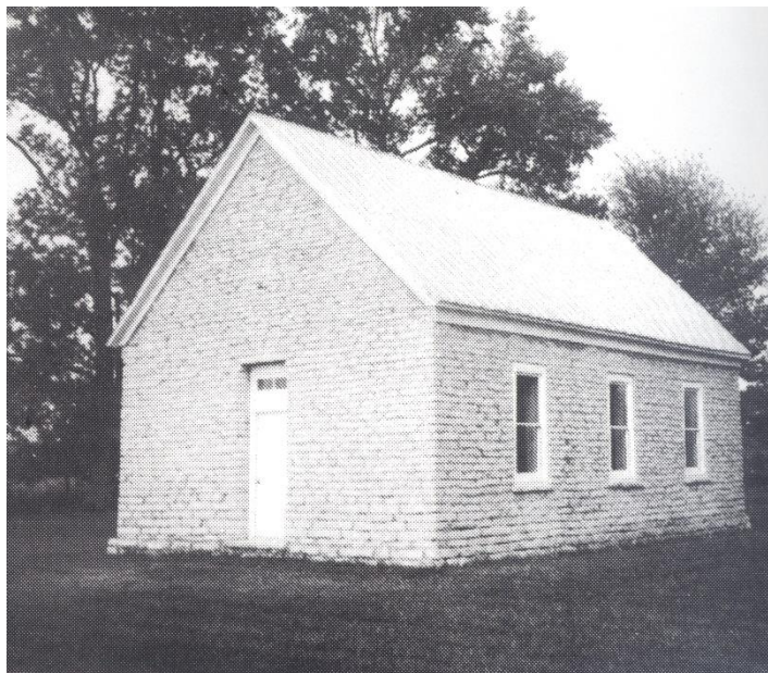
1908-1910 MALOTTE SCHOOL