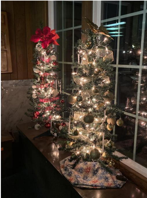
Ripley County Historical Society