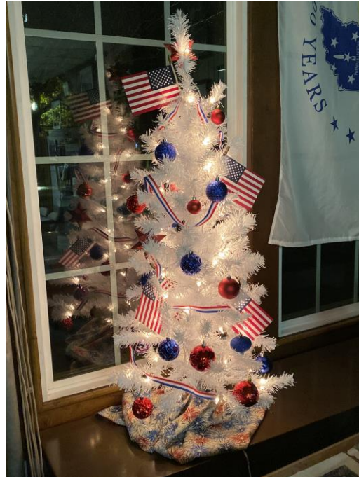
Ross' Run Chapter DAR

The Ripley County Historical Society and Ross' Run Chapter DAR entered their trees in the 1 st Annual Versailles Main Street Christmas Tree Decorating contest. The square was lit up with twenty decorated trees by area businesses and organizations.