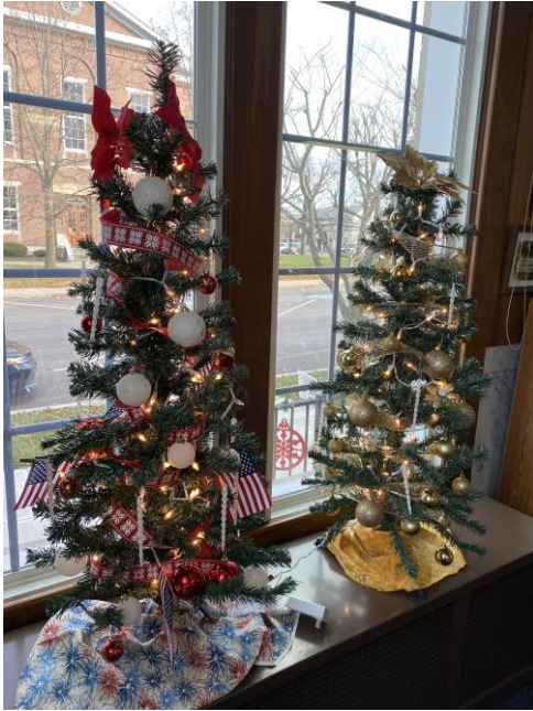
Ripley County Historical Society