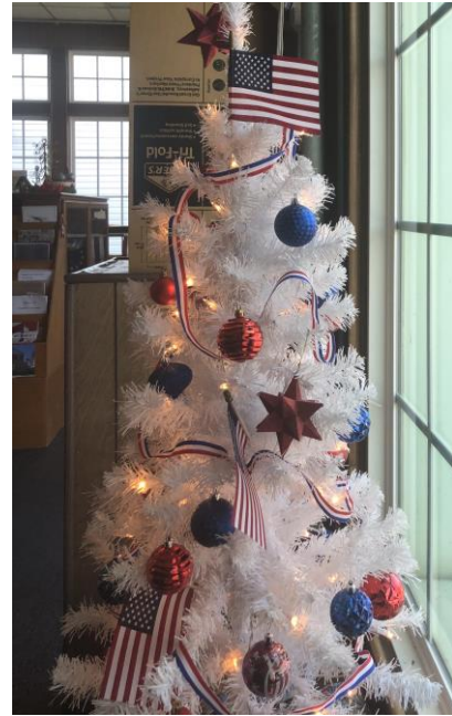
Ross' Run Chapter DAR

The Ripley County Historical Society and Ross' Run Chapter DAR entered their trees in the 2nd Annual Versailles Main Street Christmas Tree Decorating contest. The square was lit up with twenty-one decorated trees by area businesses and organizations.