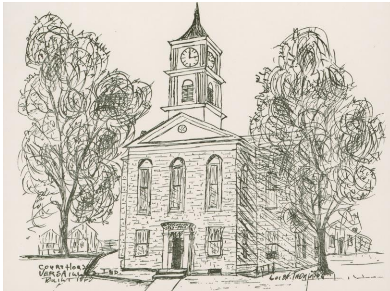
Ripley County Courthouse Note Cards Available for purchase 10/$5

If your community has an upcoming event you would like mentioned in our September newsletter, contact us at rchslib@gmail.com before March 15, 2024.