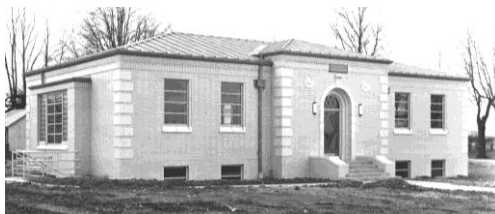
Tyson Library built 1941