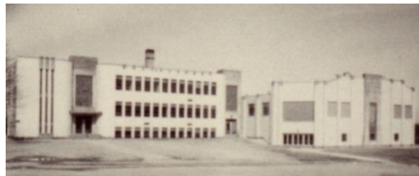
Versailles School built 1938 Auditorium built 1950